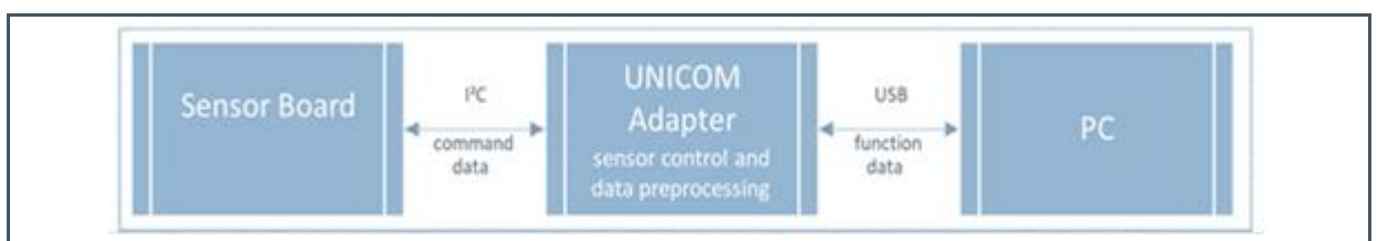
Figure 2: Hardware Solution of the SDK with a Unicom Interface to the PC

The Evaluation Kits for the AS7343 or AS7352 are described in their specified user manual. All the technical details for the sensor chips can be found in the datasheet. It is recommended to study both documents before using the SDK because in this description only specific details of the SDK are described. The SDK includes hardware and software parts. The hardware is identical to the used components in the EVKs and consists of a sensor board and I 2 C interface connected via USB to the PC.